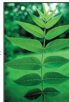
Leaves of butternut tree.